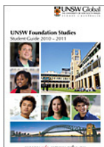
UNSW Foundation Studies (English)