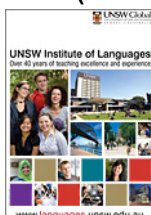
UNSW Institute of Languages