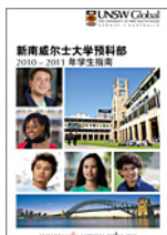
UNSW Foundation Studies (Chinese)