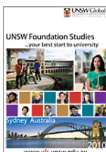
UNSW Foundation Studies